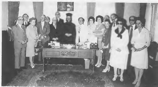
Archons and families pose with Patriarch Demetrios in the Patriarchal Office following an audience at the Patriarchate.