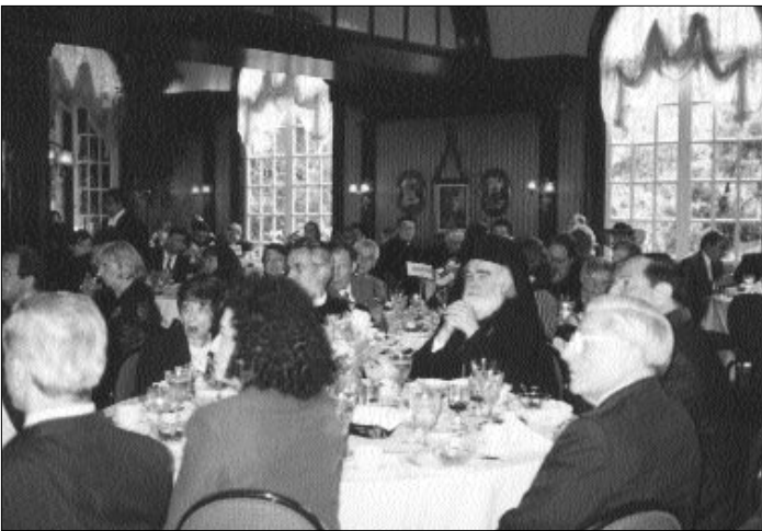
Luncheon of Archons – Atlanta