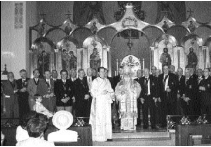
Service in Cathedral of Atlanta