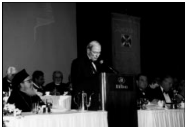
Executive Vice Commander addresses captive audience at Banquet