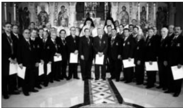
NEWLY invested class of 2000

Leading the nation, were eight new Archons from the Empire State of New York, followed by the Golden State of California by four, New Jersey, Massachusetts and Illinois were represented by three, while from Colorado, Georgia and Pennsylvania were two. Alabama, Wisconsin and Washington were represented by one each. The newly invested Archons for the Class of 2000 follows: