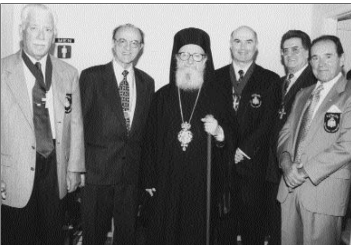
Archons meet with His Eminence